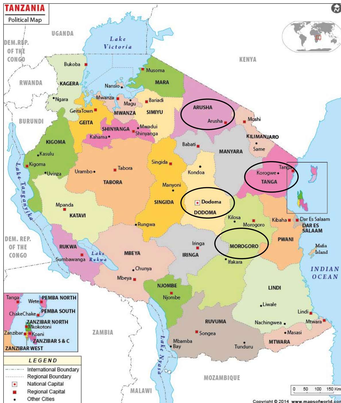
Figure 1. Survey regions cultivating traditional African vegetables for seed production include: Tanzania: Arusha, Tanga, Morogoro, and Dodoma.